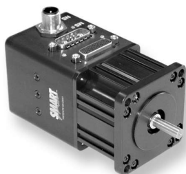
SM2310D-DNP shown with DeviceNet™ option "Plus" firmware