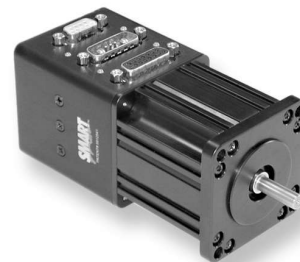
SM2320D-PBP shown with Profibus option "Plus" firmware