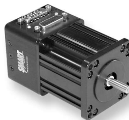
SM2320D shown with standard D-sub connector