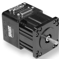
SM2310D shown with standard D-sub connector