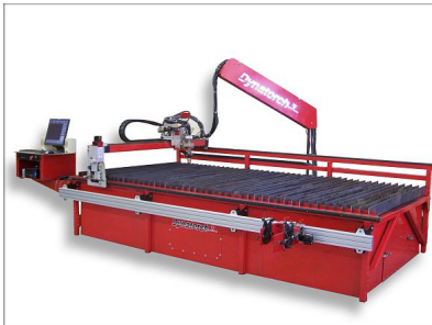
A DynaTorch plasma CNC machine controlled by the SmartMotor™

SmartMotor™ technologies utilize a true servo, unlike steppers that lead to unacceptable problems such as error accumulation and missing steps. The higher speeds achieved in plasma cutting with the SmartMotor™ technologies meant increased throughput and profits for DynaTorch™.